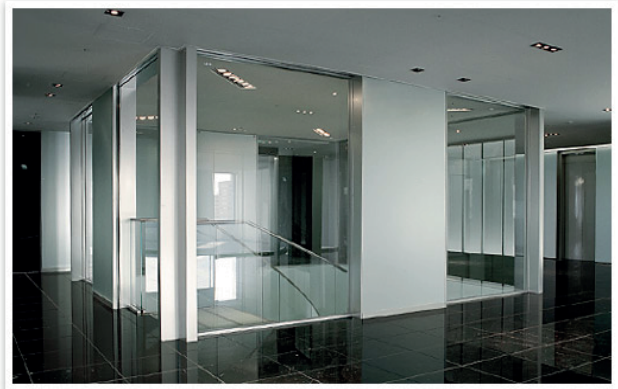
Fireproof glass screen and fire prevention door of the building core