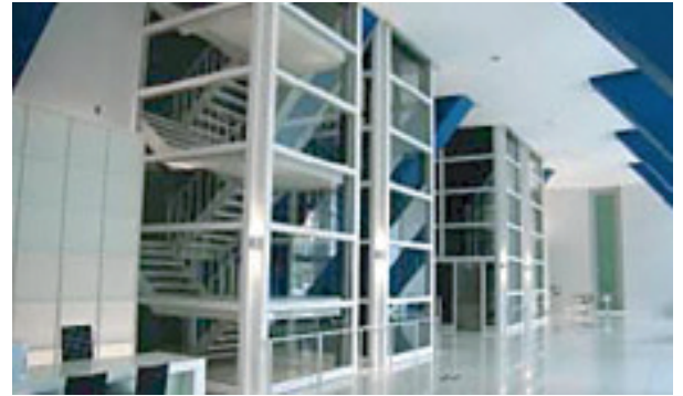
Thermal insulation glass walls applied to refuge stairs