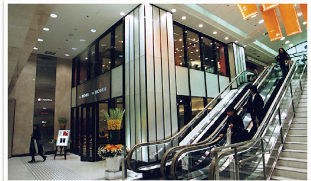
Thermal insulation glass applied to a shopping center