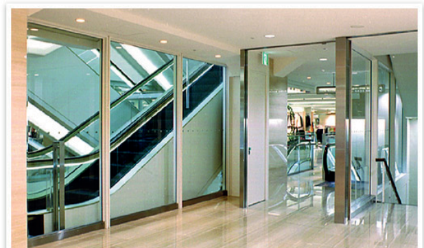
Fireproof glass screen surrounding escalator